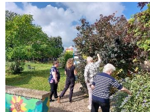
Meadows Friday Group

Our participants tell us that it has been: “confidence boosting”, “better than anti-depressants” “discovery time for me”, “you’ve brought colour into my life”, “the sessions have been very therapeutic”, “ArtSpeak has enriched me in many ways”.